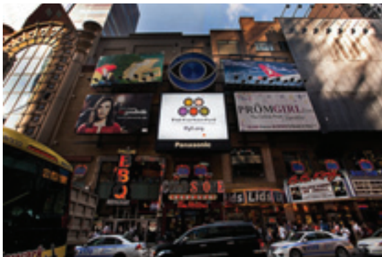
The First Five Years Fund video in New York's Times Square

The First Five Years Fund also hosted two briefings in Washington, DC, covering the business imperative of early learning programs and early learning in the Elementary and Secondary Education Act reauthorization.