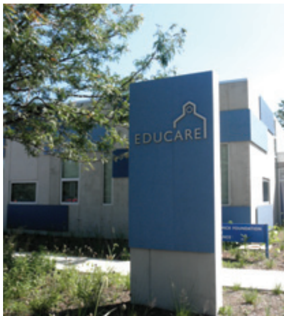
The Educare Family Center

Contributions also helped fund the Early Math Initiative, which implements effective strategies for promoting early math skills among young children, as well as the Ounce's Birth-to-Three Center-Based Training Institute, a professional-development model that will raise the quality of early childhood programs in Illinois. Finally, the campaign strengthened the Ounce's communications and advocacy efforts to increase awareness and support for early childhood education.